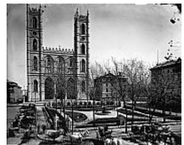
Place d'Armes and Notre-Dame Church, Montreal, 1876 William Notman © McCord Museum