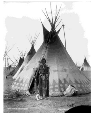
Young Niisitapikwan brave, near Calgary, Alta., 1889