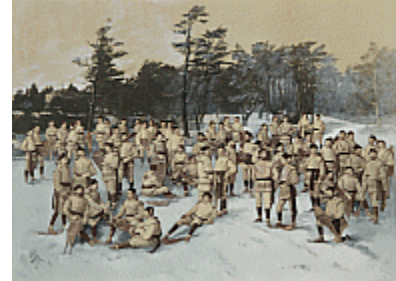
Red Cap Snow Shoe Club, Halifax, N.S., 1888 William Notman/Eugène L'Africain © McCord Museum

The Notman Collection is one of the largest collections of its kind in Canada. It contains the archives of the Montreal studio, representing some 450,000 photographs, including 200,000 glass plate negatives, portraits, landscapes and stereoscopic shots, all of which carry enormous historical value. The Notman collection also comprises 188 photo registers and 43 client directories from the Montreal studio as well as 15 books published by William Notman, some 300 painted photos, composite photos, photographic material and a number of documents, including correspondence between Notman and family members in Scotland. The collection is also constantly enriched through donations from individuals, families and collectors. For researchers and historians, it is an inexhaustible source on the history of Montreal from 1859 to 1935.