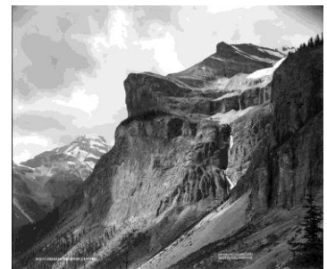
Emerald Peak and cascade, B.C., 1904