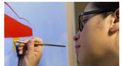
Sharing Through the Generations | Le chemin partagé