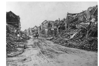
Sur la piste de Fletcher Wade Moses