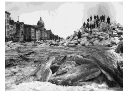
Wm Notman & Son Ice shove, Commissaires Street, Montreal, about 1884 Reversed glass plate negative ©McCord Museum

The 240-page book, published under the direction of Hélène Samson, Curator of the Notman Photographic Archives and the exhibition, includes 150 beautiful illustrations and seven scientific articles that provide new knowledge about the photographer. The book was edited by Hazan, with separate editions in English (distribution: Yale University Press) and French (distribution: Hachette) and designed by the Montreal agency Paprika. The publication was made possible through the generosity of Power Corporation of Canada.