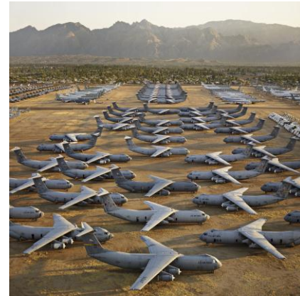
Edward Burtynsky, AMARC #5, Davis-Monthan AFB, Tucson, Arizona, USA, 2006. Chromogenic color print.

The McCord Museum thanks the Ministère de la Culture, des Communications et de la Condition féminine du Québec, the Conseil des arts de Montréal, and its partners Astral, La Presse and The Gazette, for their support.