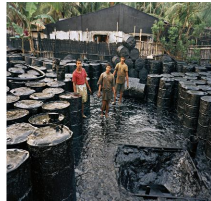
Edward Burtynsky, Recycling #2, Chittagong, Bangladesh, 2001. Chromogenic color print.