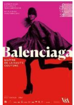
Visual from the exhibition

The exhibition takes an almost analytical look at the creative genius of the Spanish couturier, from the design of clothing pieces to the incredible expertise required to put them together. This master's legacy inspired his disciples, such as Courrèges and Ungaro, who trained and worked at Balenciaga's Parisian studio, as well as the designers who have followed in his footsteps from the end of the 20th century to now. This major fashion exhibition was organized by the Victoria and Albert Museum (V&A) in London and is presented by Holt Renfrew Ogilvy.