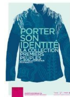
Visual from the exhibition