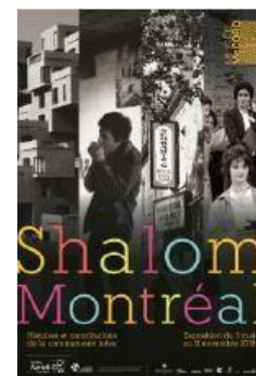
Visual from the © McCord Museum exhibition, 2018