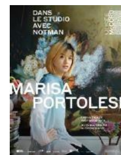
Visual from the exhibition