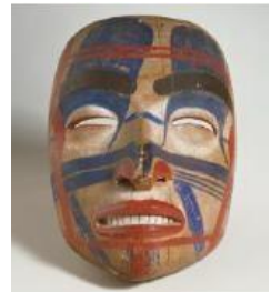
Unknown artist, Haida mask, 1800-1850, collected by George Mercer Dawson in 1878. ME892.32.2

Contemporary Haida artists are constantly exploring the ancient language of their art; it is the foundation on which new endeavours are built and the grammar with which future histories are written. For this exhibition, works of contemporary Haida artists will serve as a complement to this corpus of objects. The McCord Museum has a rare collection of Haida objects.