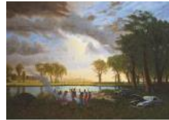
Kent Monkman, Reincarceration , 2013, acrylic on canvas, Glenbow Museum Collection

Kent Monkman is a Canadian artist of Cree descent. His work deals with the themes of colonization, sexuality, loss and resilience in the historical context of contemporary Indigenous communities. A multidisciplinary artist, he creates using various media, such as paintings, video, performance art and installations.