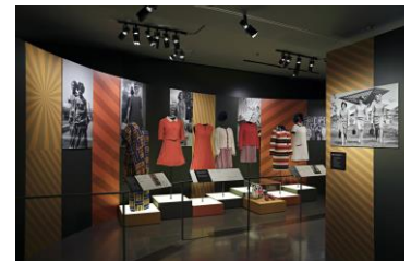
Fashioning Expo 67 exhibition