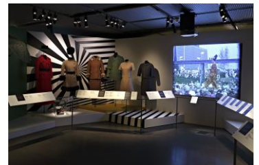
Fashioning Expo 67 exhibition