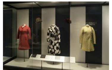
Fashioning Expo 67 exhibition