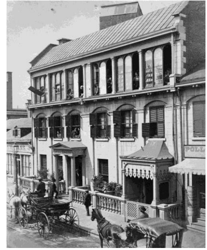
William Notman studio, 17 Bleury Street, Montreal, about 1875  