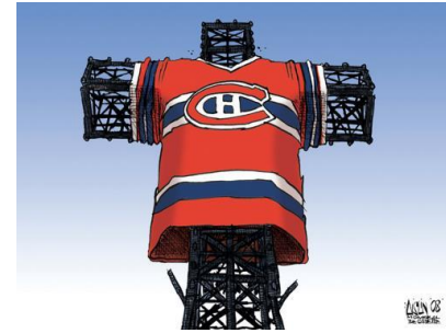
Aislin, Mount Royal Cross, The Gazette, March 13, 2008. Gift of Terry Mosher

This exhibition will present a retrospective of the best cartoons created by Aislin over the 50-year course of his far-reaching career. As a result of his long career at the Gazette newspaper, his loaded publication history, and his acute perspective on Canadian news, he has become one of the most influential cartoonists in English Canada – past and present. Maclean's even called Aislin “probably the best satirist in Canada.” The liveliness, pertinence, and cruelty of his cartoons spare few public personalities and leave no one indifferent. They reflect Canadian society in its beautiful and less glorious moments. In 2017, Aislin will present the McCord Museum with the fiftieth cartoon of the exhibition. Related to this exhibition, the McCord Museum will also host a day of animation films about Aislin.