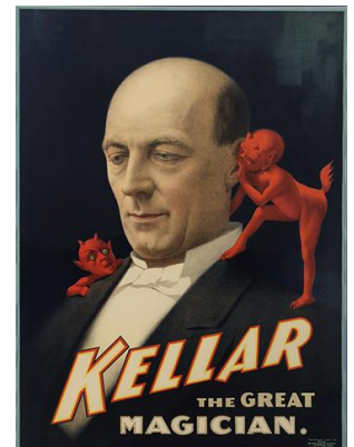
Kellar The Great Magician Strobridge Lithographing Co., 1894

The exhibition will take on the period of magic shows' golden age and its advertising and promotional mechanisms, which relied on phantasmagoric imagery. A selection of 75 breathtaking posters, most dating from the late 19 th and early 20 th centuries, will retrace the social history of this still active phenomenon. These posters, halfway between art and advertisement, are magnificent, large format chromolithographs that immortalize the magicians