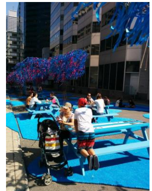
The Urban Forest , 2015

The McCord Museum is offering a number of special activities, including the distribution of fruits and vegetables by Lufa Farms and teas by DavidsTea, and the launch of series of bimonthly swing dance workshops by Cat's Corner.