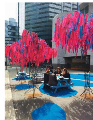
The Urban Forest , 2015 © McCord Museum