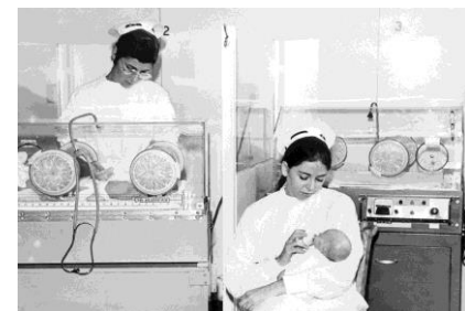
Anonymous, Nurses tending to newborns in neonatal ward, Jewish General Hospital, Montreal, about 1960s.