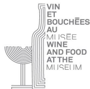
Wine and Food at the Museum