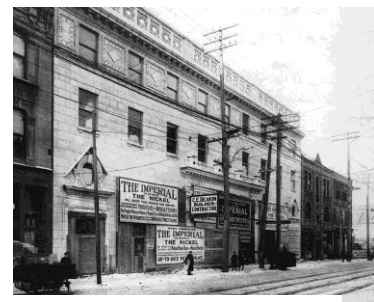
Imperial Theatre, De Bleury St., Montreal, 1913 (detail)