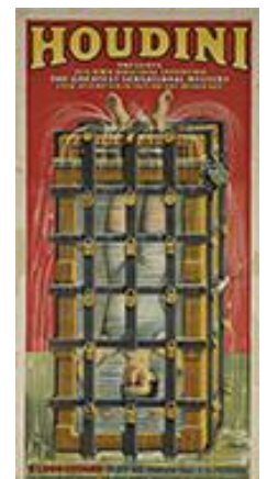
Houdini The Water Filled Torture Cell Strobridge Lithographing Co., 1916