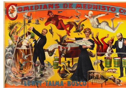
Le Roy, Talma, Bosco World's Monarchs of Magic Adolph Friedländer, 1905 M2014.128.318

Montreal, May 23, 2017 – From May 26, 2017 to January 7, 2018, the McCord Museum presents Illusions – The Art of Magic , an exhibition featuring magic show posters never seen in public before. Dating from the Golden Age of Magic, the 1880s to the 1930s, the illustrations use phantasmagorical imagery to advertise magic acts beyond the comprehension of ordinary people. Consisting of 71 magnificent chromolithographs and wood engravings, some of them very large format, the exhibition highlights the most celebrated stars of the period: Herrmann, Kellar, Chung Ling Soo, Thurston and, of course, Houdini. Developed by the McCord Museum, Illusions – The Art of Magic draws from its Allan Slaight Collection, acquired in 2015.