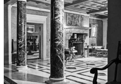
1475 des Pins Avenue West, Montreal, 1974

From the 1910s to the 1930s, prominent Montreal businessmen, among them Louis-Joseph Forget, hired the best architects of the day to build them luxurious Edwardian style homes. This exhibition bears witness to a bygone way of life. The exhibition features 40 stunning black and white photos, taken in natural light in 1974 by young Montreal architect and photo artist Charles C. Gurd. They illustrate the interiors of these exceptional mansions, which have since disappeared or been altered, victims of changing times, tastes and generations.